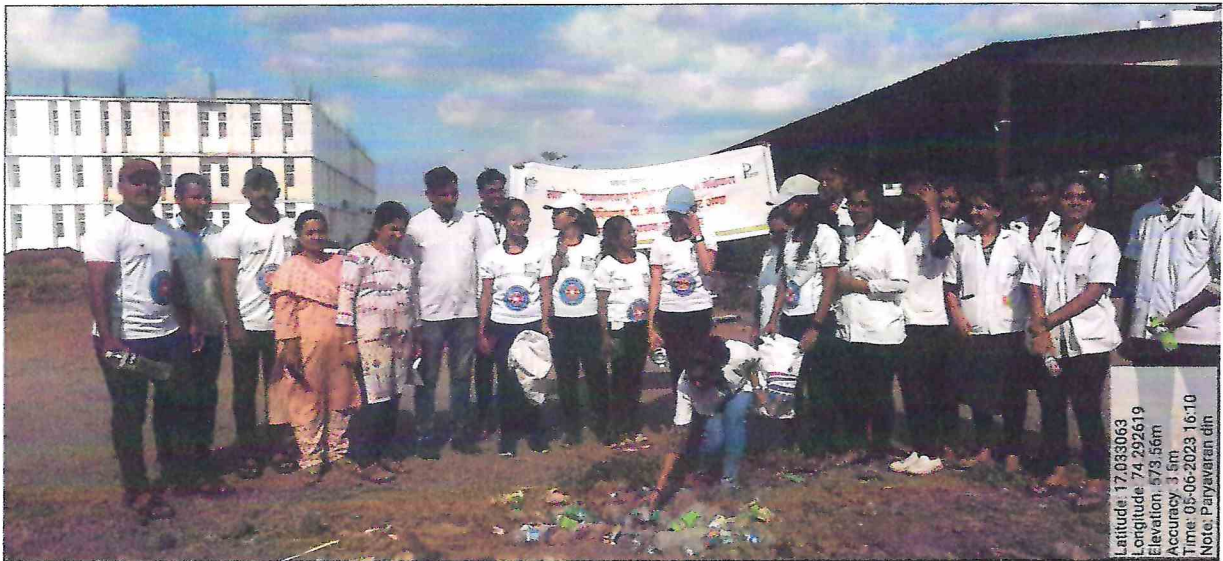
Plastic Waste Collection