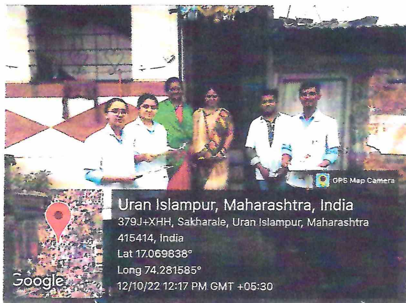
Health Survey in Sakharale and Rethareharnaksha