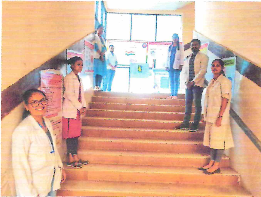
Ayurvedic Recipes competition