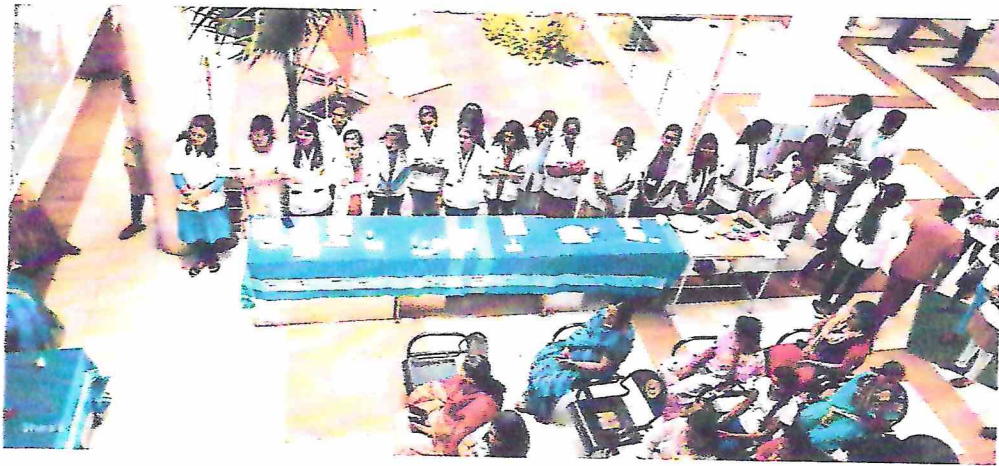
Ayurvedic Recipes competition