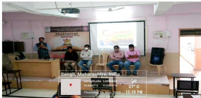
Speech by Dean