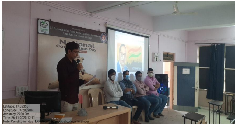
Reading of Preamble of Constitution